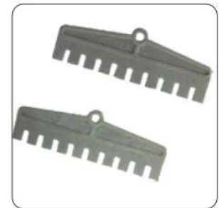
Disconnection Plug 10 Pair