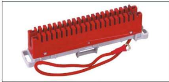
Grounding Module - 10 Pair