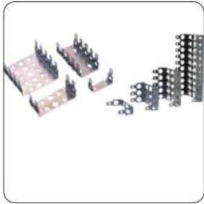
Back Mount Frame