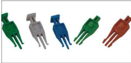
Disconnection Plug 1 Pair