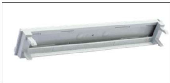
Hinged Label Holder